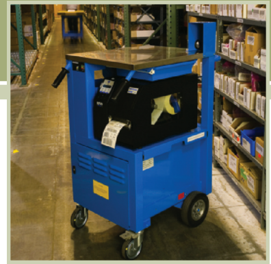
Shown with T5000r™ printer (not included)